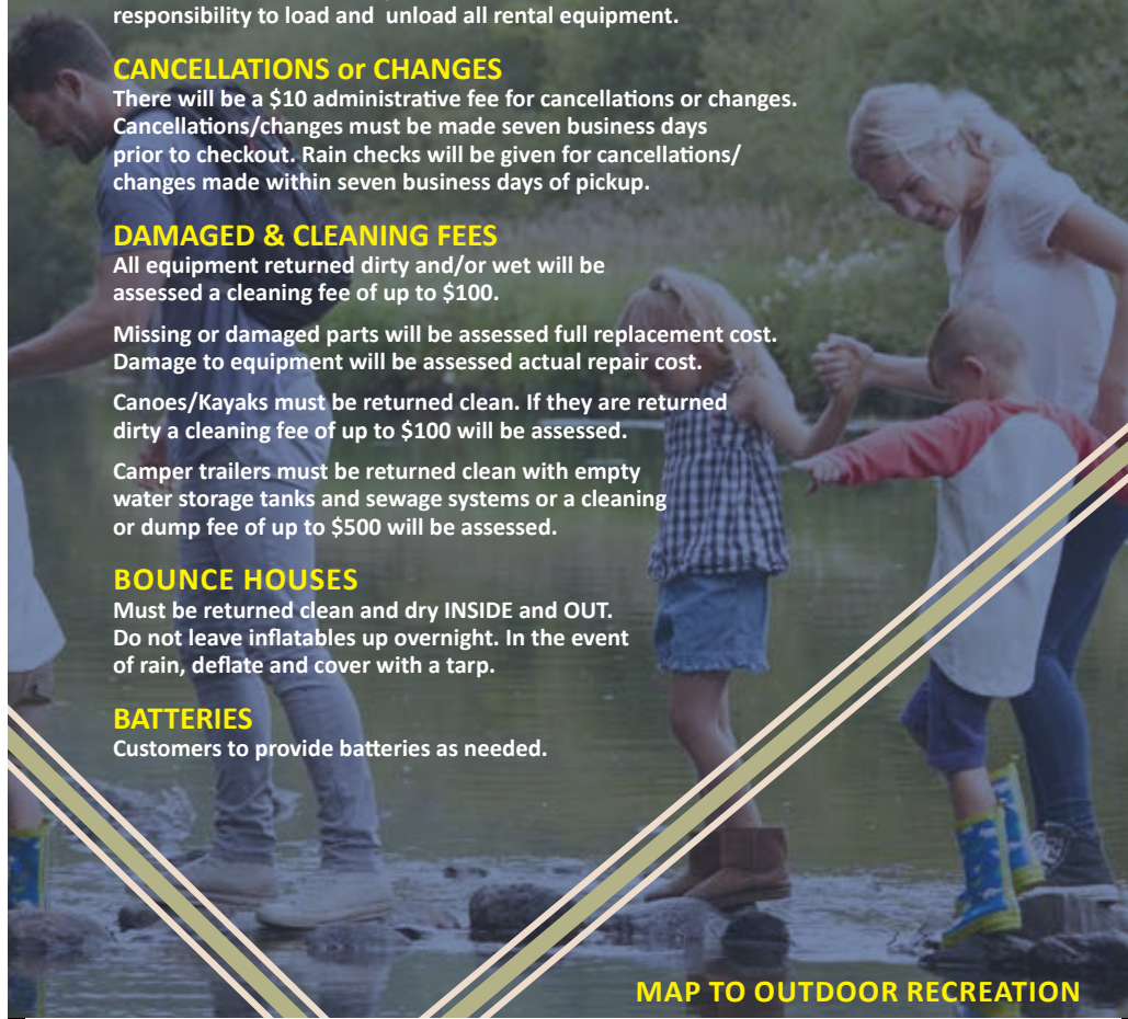
MAP TO OUTDOOR RECREATION

Customers to provide batteries as needed.